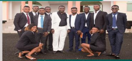
Student Union Representatives-Level 2/3

N.B. VISIT/CONTACT THE OFFICE FOR MORE DETAILS ON REGISTRATION AND STUDY FEES.